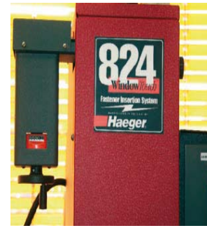
The optional hard stop prevents the high press capacity from deforming soft materials like aluminium.

the process than to have sort out faulty parts later. Previously, we checked critical parts at 100% with test templates, however even with this method, the delivery of faulty parts could not be ruled out. With the new Haeger, we can now move quality assurance closer to the process and improve process reliability. Any chance of missing or forgetting fasteners with the appropriate maintenance sequence, and even mixing up fasteners will be definitely ruled out." And if the fasteners hold, then nothing else can go wrong. The new Haeger from SMB is convincing on this point,