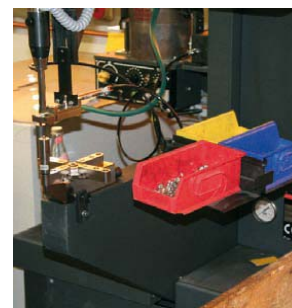
With screen's colored flow on the WindowTouch, the operator can recognize from which bin the respective insertion element must be taken.